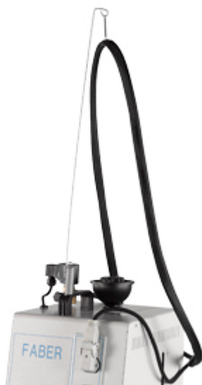
Cable holder rod