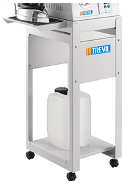
Refill tank included