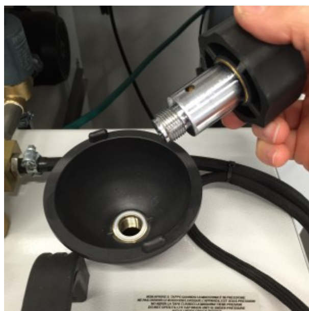
Built-in refill funnel